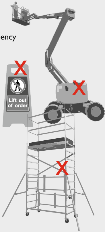
Physical access costs are eradicated

All detectors, regardless of location, should be tested and maintained in compliance with international codes and standards. Installing Scorpion supports this and eliminates the need for deviations from such standards – offering ultimate peace of mind and proof that all detectors within a building are functioning as expected.